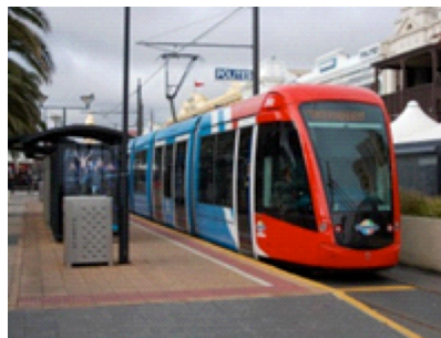
Tram at Moseley Square, Glenelg

Adelaide is also home to the only guided busway track in the southern hemisphere – the Adelaide O-Bahn. Specially equipped buses travel at speeds up to 100km/h along the busway, from North Adelaide to the Tea Tree Plaza shopping centre at Modbury, in the north-east suburbs. The 12km journey on the track can be completed in as little as 10 minutes on an express service, however, the average journey is around 20 minutes.